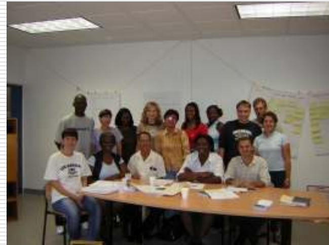
Everyone will identify with the ethos of the SHS as a unique organization; dedication and teamwork is a hallmark of SHS.