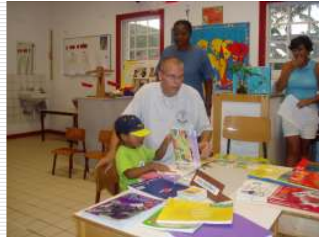
Participation at a parent evening