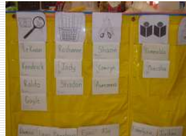
The "Center Chart" is a tool that helps the teacher to organize center work

9:20 After the children have worked in the centers, the teacher invites the group back on the mat and reads a poem.