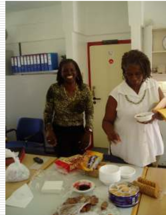
Lunch on International Teachers' Day