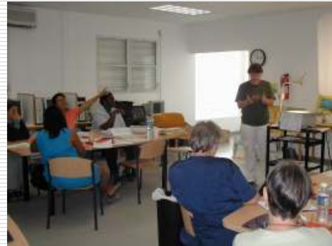
Weekly meetings and training sessions