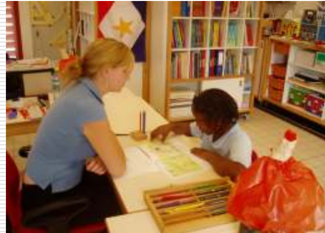
Special Ed teacher working one-on-one