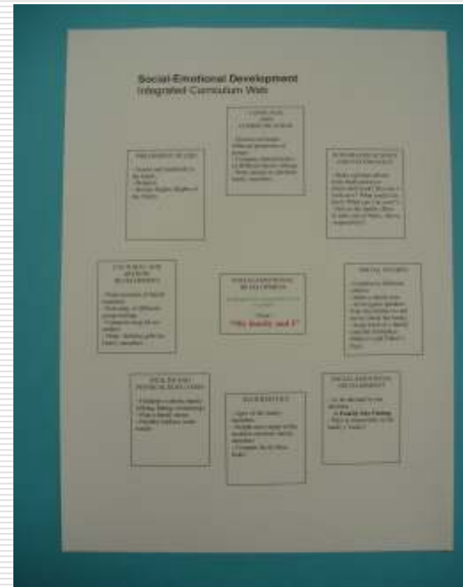
Preparing a project in a web