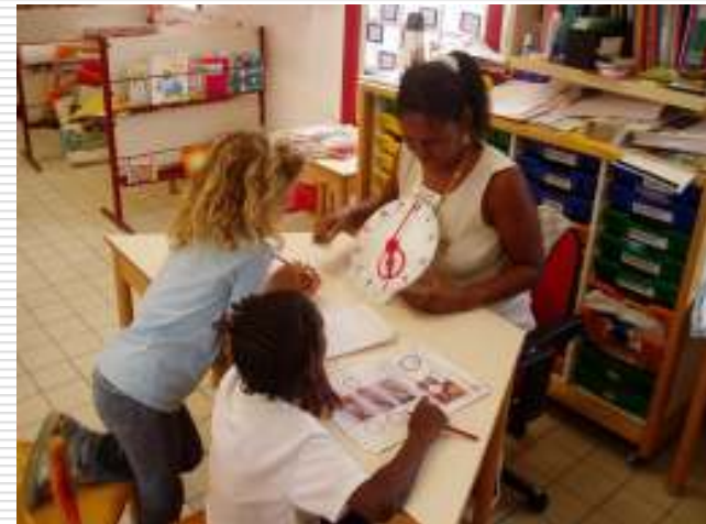
Teacher working with a guided group in Math

11:05 After Math, the teacher gives new assignments for other educational areas: - Some students are making a family tree in the social study center; - Another group works on self-portraits in the art center; - In the drama center some students act out the big book story; - In the writing center children are writing stories about their families; - For Dutch language skills they perform a skit in Dutch.