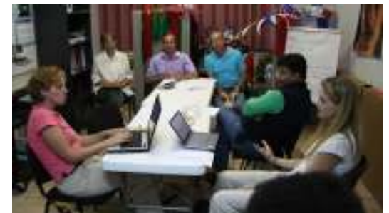
Board of the AIDS Support Group Saba