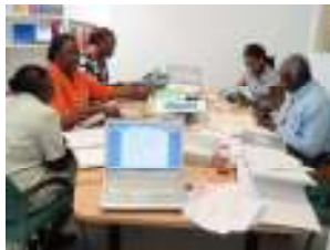
The 3 teachers with their trainers

So, join us in our journey to ensure that our students make the best of this learning experience.