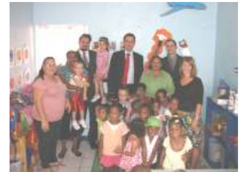
Minister André Rouvoet of Youth & Families visiting the Daycare Center